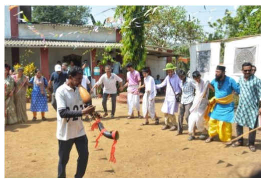
Visitors being part of the experience

For the local communities, the festival was a moment of immense pride, as it was the first time such a large audience visited their villages to celebrate and honour their cultural heritage. Beyond the recognition, the festival played a transformative role in strengthening community ties. The process of co-designing, organizing, and managing the event fostered collaboration among and within different villages, enhancing local leadership and teamwork. Traditional cultural practitioners gained visibility and market exposure, finding new platforms to share their skills while directly benefiting from the revenue generated through craft sales, food stalls and others. Additionally, interactions with visitors from different domains instilled confidence in the community, reinforcing the value of their traditions and encouraging them to continue safeguarding their intangible heritage for future generations.