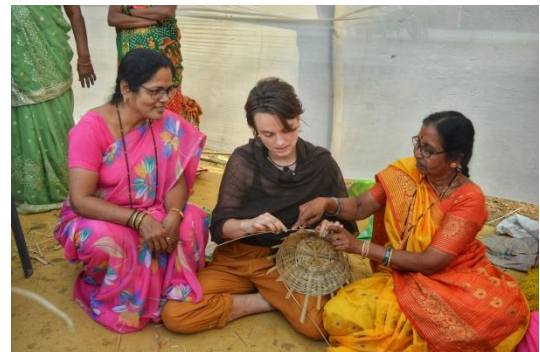
Visitors trying their hands in traditional crafts

Performing Arts - The festival's cultural vibrancy came alive through mesmerizing performances by 19 local groups, presenting 12 distinct folk songs and dance forms. Dance performances such as Tarpa, Hodi, Kambadi, Ghor, Koli, Gavari, and Dhol captured the rhythm of local traditions, while traditional instruments like the Tarpa, Sambal, Dhol, Rohe Badan, Thali Badan, and Dhumsa resonated across the festival grounds. Wedding songs such as Sawasini Dhouleri added to the celebration, offering visitors a glimpse into the musical heritage that plays an integral role in local festivities, rituals, and daily life.