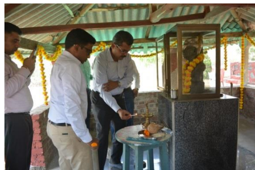
Festival Inauguration with MTDC Officials and Community Representatives

Warli Exhibition - A significant highlight of the festival was the Warli art exhibition, which paid tribute to the legendary Padma Shri Jivya Soma Mashe. Held at his residence, the exhibition showcased his iconic Warli paintings, offering visitors a rare glimpse into the artistic legacy that put this tribal art form on the global map. Additionally, the festival grounds featured an exhibition of paintings by renowned local artists, providing a broader platform for Palghar's artistic talents to gain recognition and appreciation.