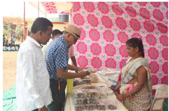
Visitors tasting traditional food in the festival