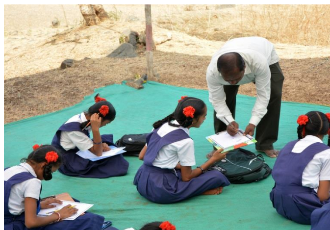
Workshop with Students