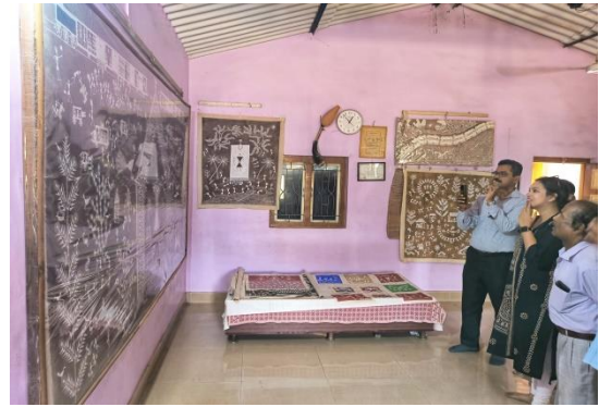
Warli Exhibition in the Festival

Demonstration of Traditional Crafts - Visitors had the unique opportunity to engage with traditional crafts through interactive workshops led by skilled artists. Sessions on Warli painting, bamboo basketry, and tarpa instrument making allowed participants to try their hand at these indigenous crafts, fostering a hands-on understanding of the artistic traditions deeply rooted in the region. These workshops not only served as learning experiences but also encouraged dialogue between artists and visitors, strengthening appreciation for local craftsmanship.