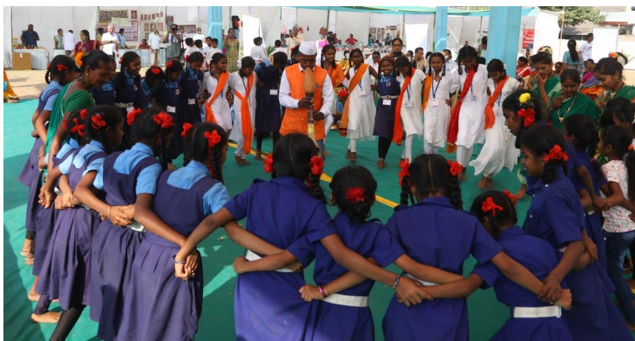
Visitors experiencing local culture