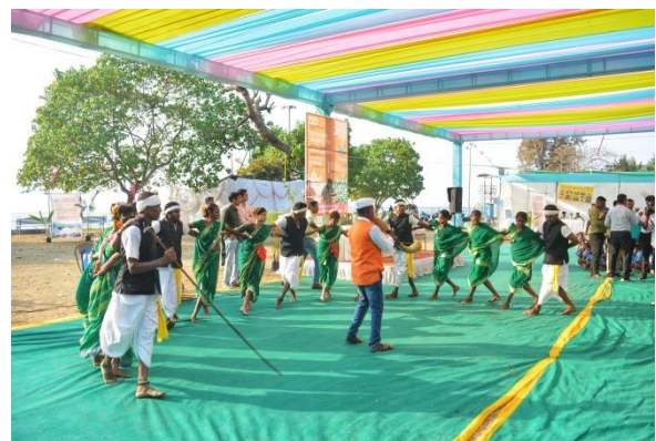
Live Performances : Hodi Dance (left), Tarpa dance (right)