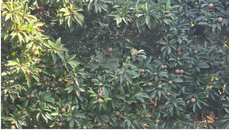
Chikoo Orchards in Gholwad

Chikoo Trail - Gholwad and the Bordi belt, known as Maharashtra's 'Chikoo Capital,' offered an immersive agro-tourism experience through guided Chikoo trails. Visitors explored the lush orchards lining the coastal landscape, witnessing firsthand the sustainable farming techniques practiced by local farmers. The trails provided an opportunity to taste fresh Chikoos and sample locally processed products such as Chikoo chips, pickles, and other delicacies, highlighting the region's deep connection to this fruit and its significance in the local economy.